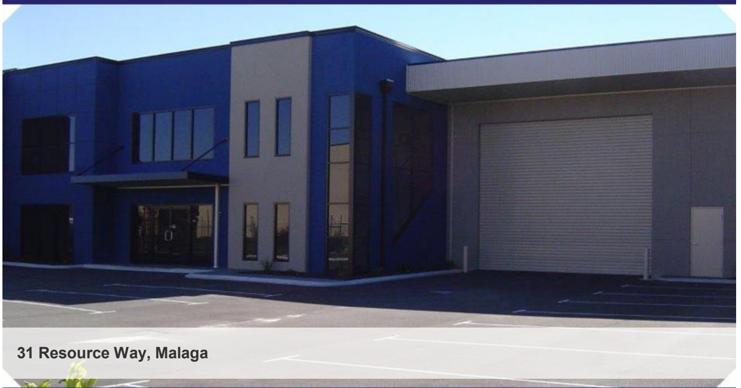
31 Resource Way, Malaga