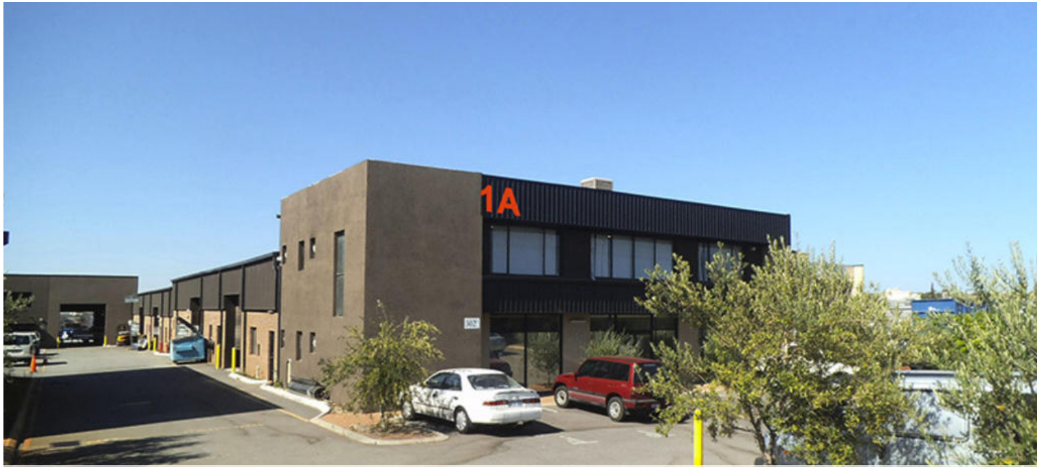
1a, 302 Victoria Road, Malaga