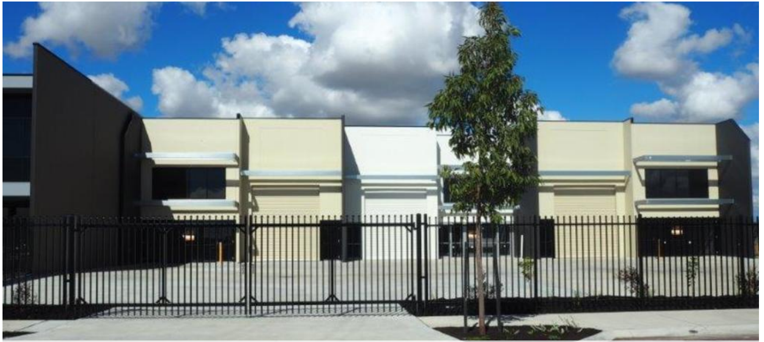
12 Weedon Road, Forrestdale