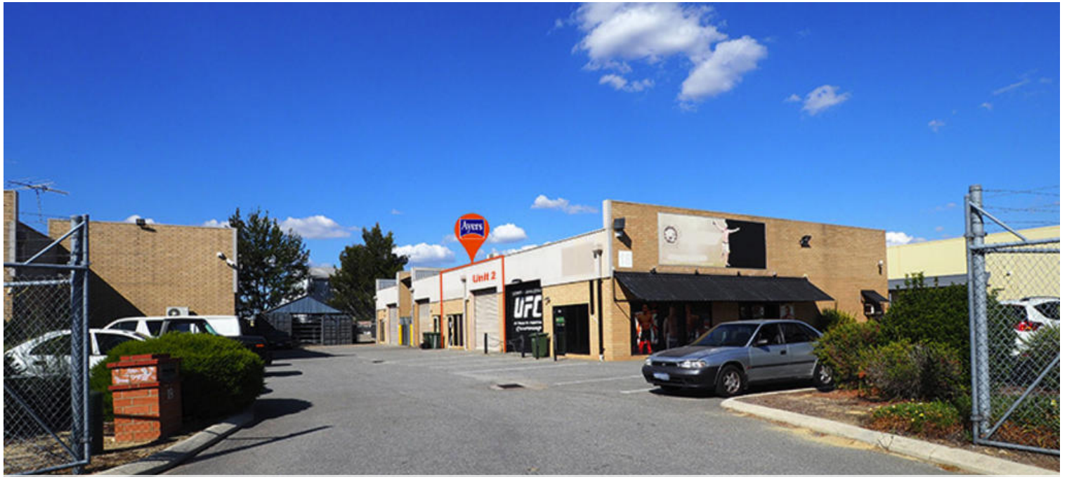
Unit 2, 18 Crocker Dr, Malaga